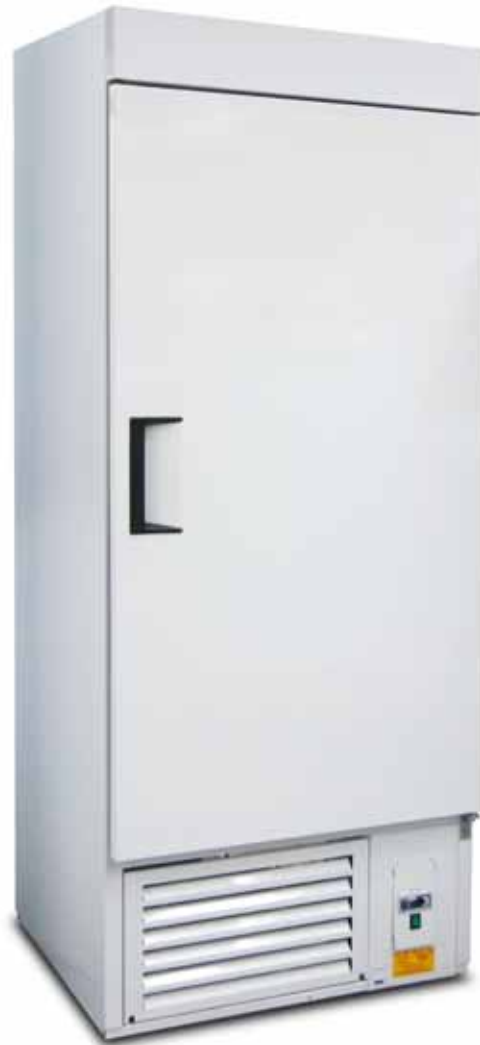
I-Jola P M Gastro*